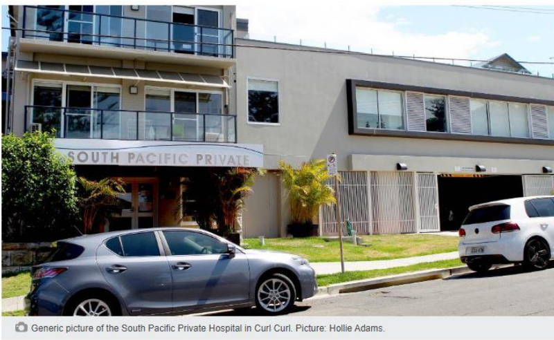
Generic picture of the South Pacific Private Hospital in Curl Curl.